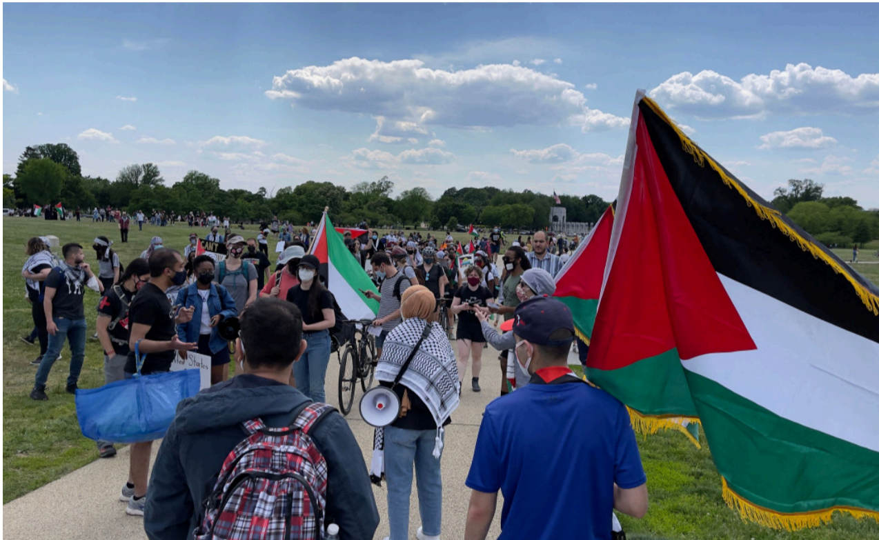
( https://www.newarab.com/sites/default/files/1232909840.jpeg )

( https://www.addtoany.com/share?url=http://www.newarab.com/news/vermont-workers-council-slams-israeli-apartheid&title=%C2%A0Vermont%20world )