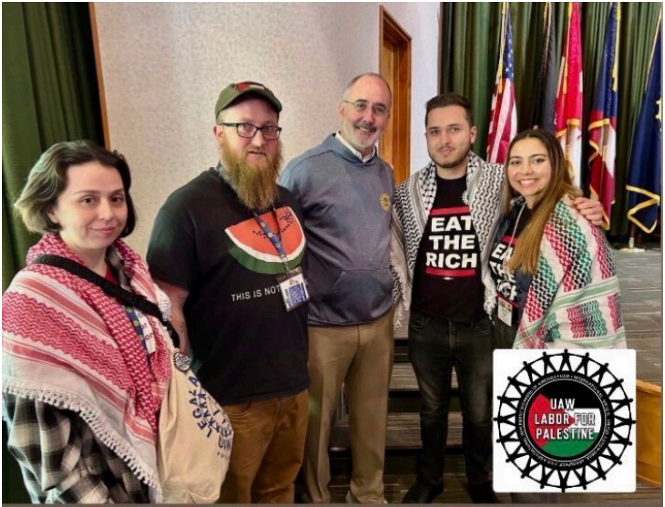
UAW PRESIDENT SHAWN FAIN POSES FOR A PHOTO WITH MEMBERS OF UAWL4P SHORTLY AFTER SAYING HE WILL VOTE FOR DIVESTMENT, OCTOBER 7, 2024.

On the morning of October 7, 2024, members of the International Executive Board (IEB) of the United Automobile, Aerospace and Agricultural Implement Workers of America (UAW) found their inboxes flooded with hundreds of emails from union members around the country. The messages all demanded the same thing: that the UAW immediately divest from a relentless U.S.-backed Israeli genocide responsible for the death of an estimated 186,000 Palestinians in Gaza .