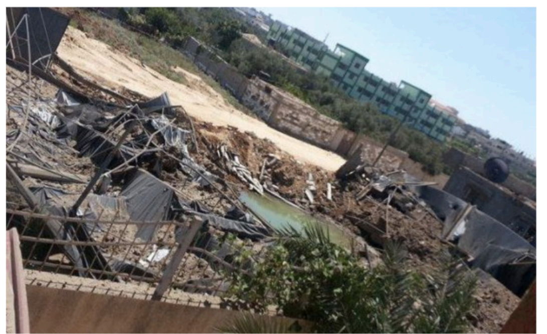
Ataa Library, Beit Hanoun