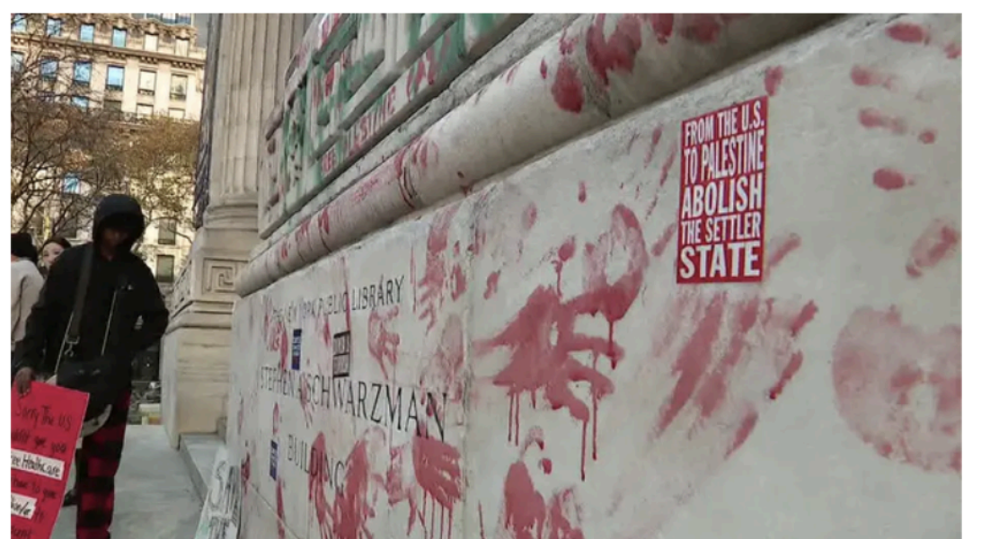
Handprints left on the Schwarzman building to protest Blackstone's complicity in civilian deaths in Gaza

SHAME ON YOU, NYPL! WE SAY PALESTINIAN LIVES MATTER MORE THAN A BUILDING NAMED FOR A ZIONIST.