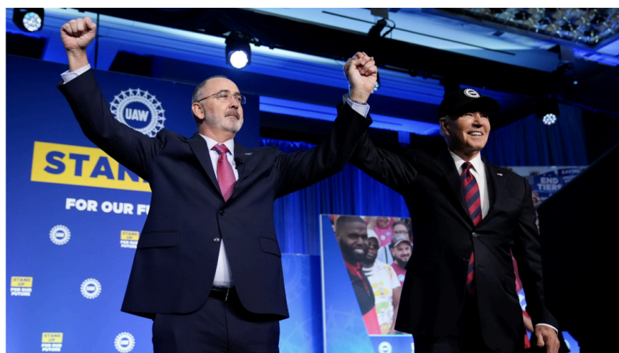
UAW President Shawn Fain stands with Biden after endorsing him for re-election this January.