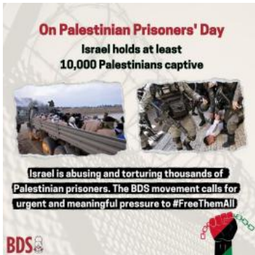
(/Israel-Holds-Over-10000-Palestinians-Captive-Act-Now-FreeThemAll) BNC STATEMENT