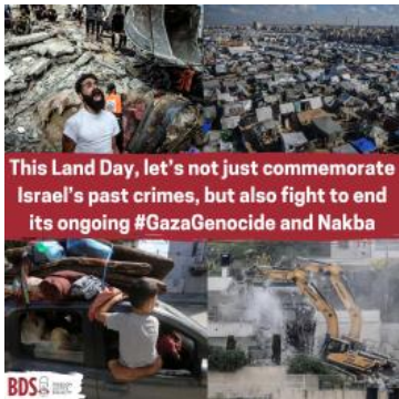
(/Land-Day-We-Wont-Back-Down-We-Wont-Get-Tired-Until-We-Stop-The-Genocide) ACTION ALERT