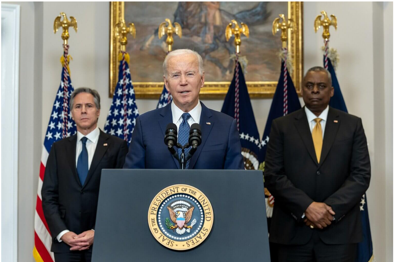
JOE BIDEN, JOINED BY SECRETARY OF STATE ANTONY BLINKEN AND DEFENSE SECRETARY LLOYD AUSTIN, DELIVERS REMARKS ON JANUARY 25, 2023, IN THE WHITE HOUSE.

Activists are calling for a ballot protest at Michigan’s February 27 primary, in an effort to push President Joe Biden to support a ceasefire and end the administration’s support for Israel’s brutal assault on Gaza.